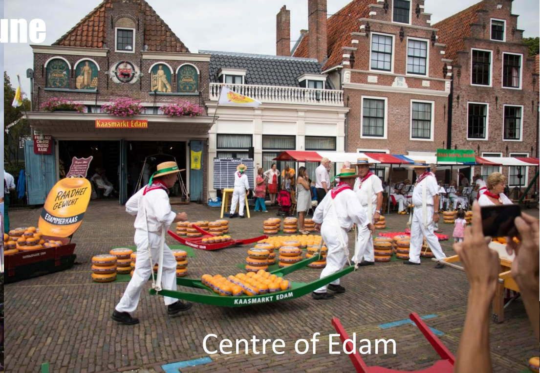
Centre of Edam