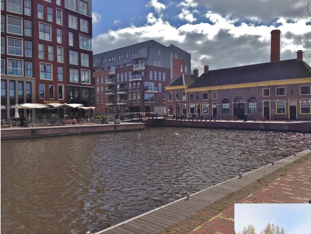
Harbor in Alkmaar